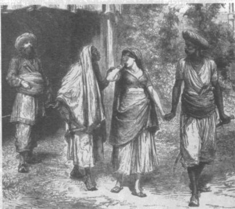
Muslim slave raiders kidnapped women from Europe for harems in the Middle East.