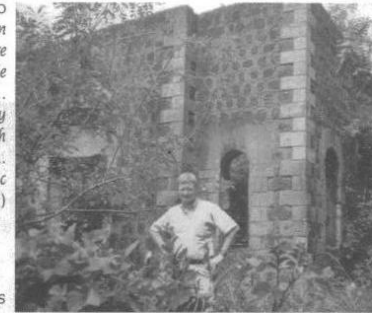
An abandoned derelict mosque overgrown by the jungle in Southern Sudan.

literary style of the Quran to be defective: "The Quran contains sentences which are incomplete and unintelligible without ... commentaries ... illogically and ungrammatically applied pronouns which sometimes have no referent ... more than 100 Quranic aberrations from (Arabic's) normal rules have been noted."