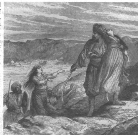
More than a million Christian Europeans were enslaved by Muslim pirates.